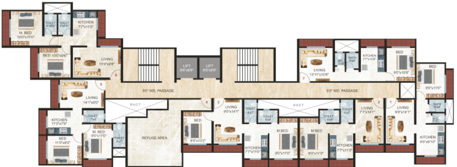
EIGHTH & THIRTEENTH FLOOR PLAN