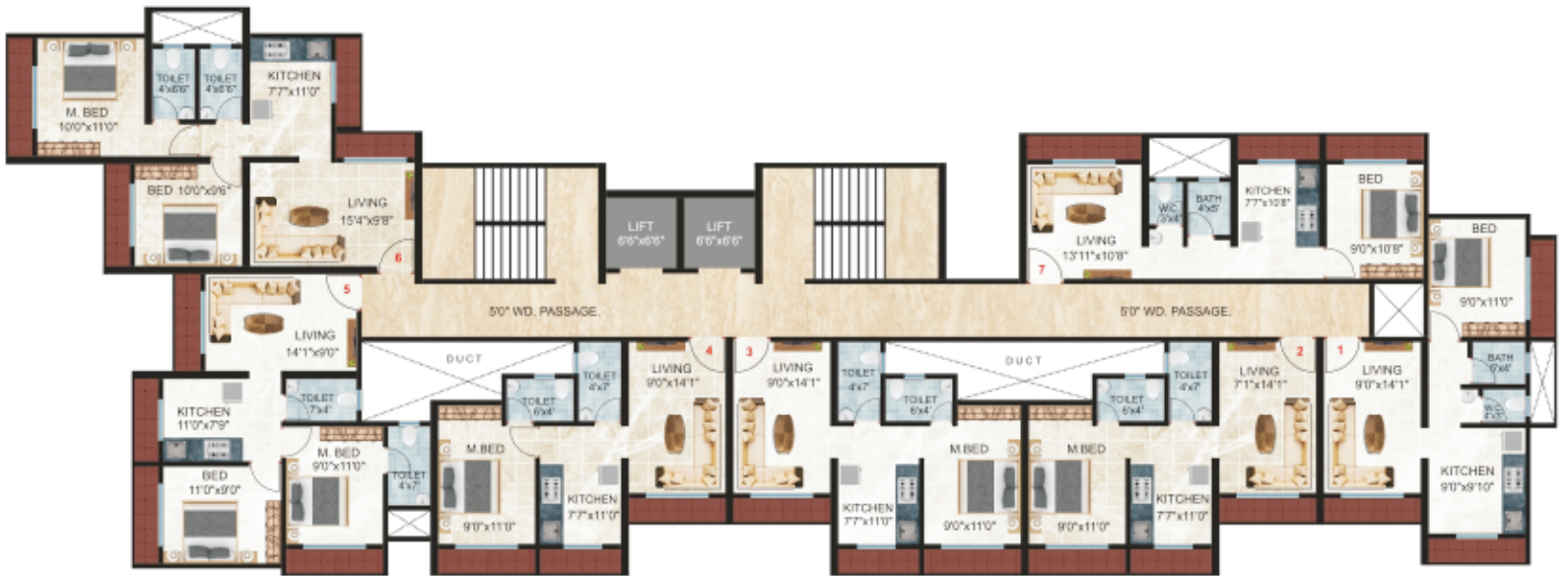
6TH, 7TH, 9TH, 10TH, 11TH, 12TH, 14TH, 15TH & 16TH FLOOR PLAN